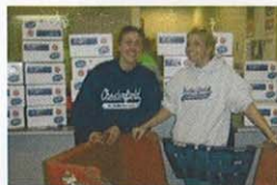
Chesterfield teachers mail student care boxes to 151 st FA.